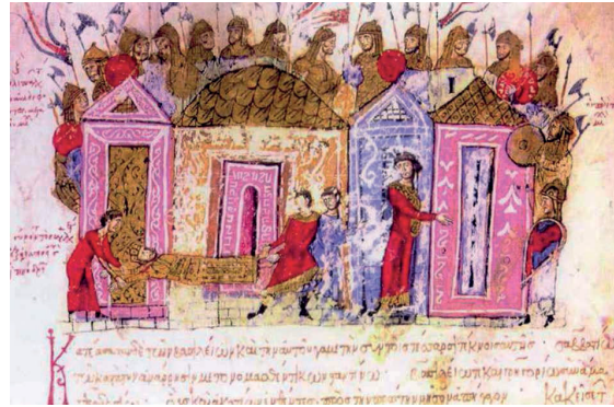
Fig 154. Varangian Guardsmen, an illumination from the Skylitzis Chronicle

Most conspicuously, the treaty regulates the status of the colony of Varangian merchants in Constantinople. The text testifies that they settled in the quarter of Saint Mamas. The Varangians were to