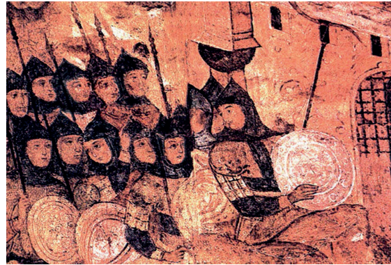
Fig 152. The al-Rus' under the walls of Tsargrad (Constantinople). Detail from a medieval Russian icon.

It is not clear when the al-Rus' and the Byzantines first came into contact. One of the first mentions of the al-Rus' (Rhos) near the Byzantine Empire in addition to Annales Bertiniani comes from Life of St. George of Amastria a hagiographic work whose dating is debated. According to this the Byzantines had first come into contact with the al-Rus' in 838. The exceptional timing of the attack in 860 suggests the al-Rus' had been informed of the city's