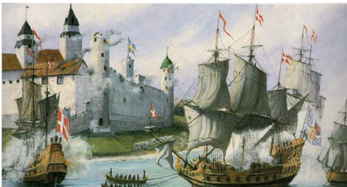
Fig 150. Visborg castle falls Painting by Erik Olsson

From the Swedish side the thought was that the island has been to so much trouble that they twice tried to get rid of Gotland. The first time was in 1806 when the then Swedish government offered Gotland to the Knights of Malta but they declined. The second time was in 1932 when from Swedish side the thought was that Gotland was so difficult and expensive to have that they had advanced plans to deport all Gotlanders to Sweden and to give Gotland away to the power that wanted it. In that time the Soviet Union.