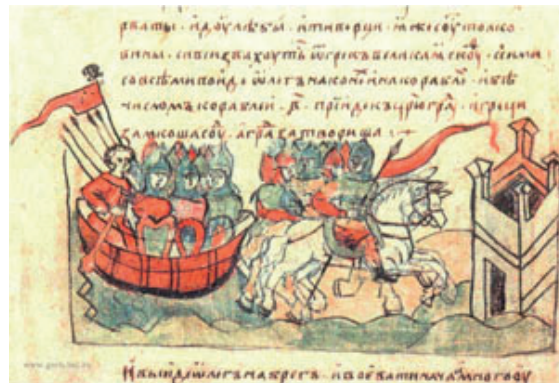
Fig 153. Oleg of Novgorod leads an army to the walls of Constantinople. Miniature from Radziwiłł Chronicle (early XIII century). The Rus' - Byzantine War of 907 is associated in the Primary Chronicle with the name of Oleg of Novgorod. Oleg is, however, not mentioned in the trade treaty between the Gotlandic merchants and the Byzantine Emperor of 911. The chronicle implies that it was the most successful military operation of the Kievan Rus' against the Byzantine Empire and that the Byzantines paid a tribute of twelve grivnas for each al-Rus' boat.. Paradoxically, Greek sources do not mention it at all.

As early as 911, Varangians are mentioned fighting as mercenaries for the Byzantines. About 700 Varangians served as mariners in Byzantine naval expeditions against the Emirate of Crete in 902 and a force of 629 returned to Crete under Constantine