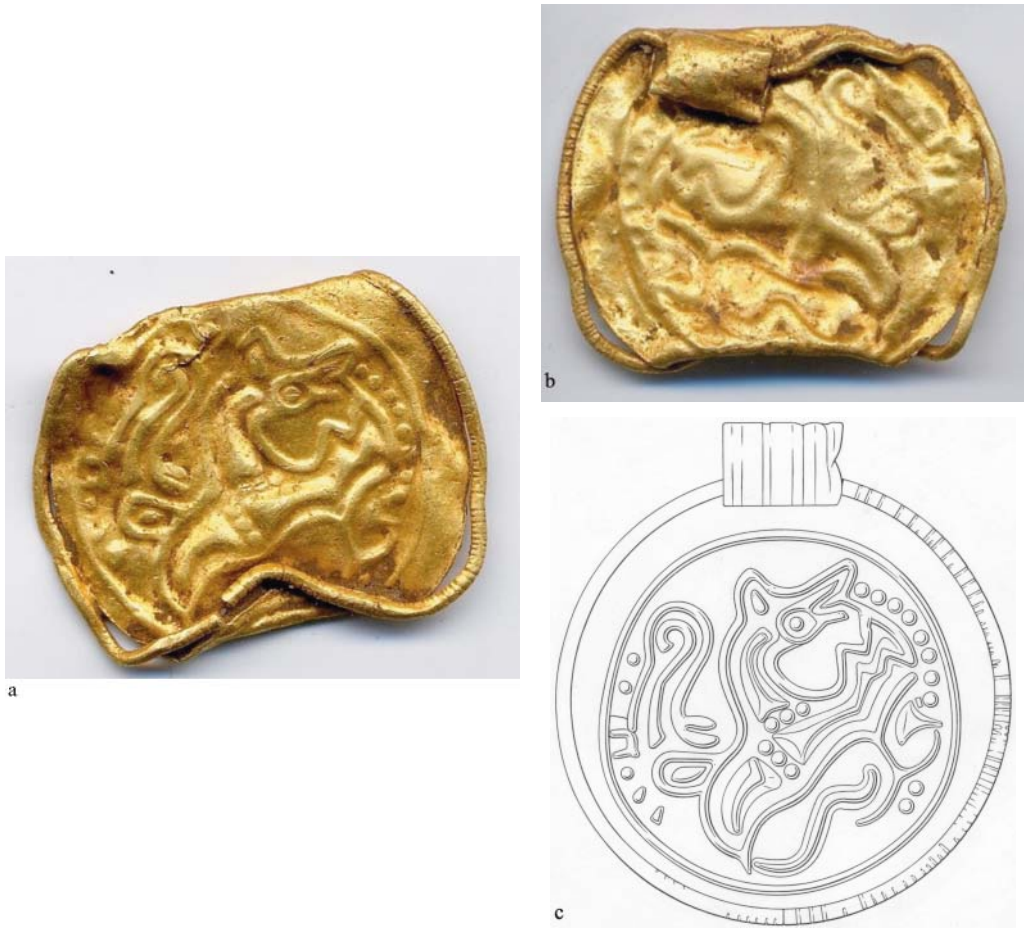
FIG 7 Gold bracteate from Hambleden (a) Front. (b) Back. (c) Reconstruction drawing. Scale 2:1. Drawing by J Farrant.

flatten the bracteate but retain the condition in which it was found. That is why some features of the design were not accessible for the description and the drawing.