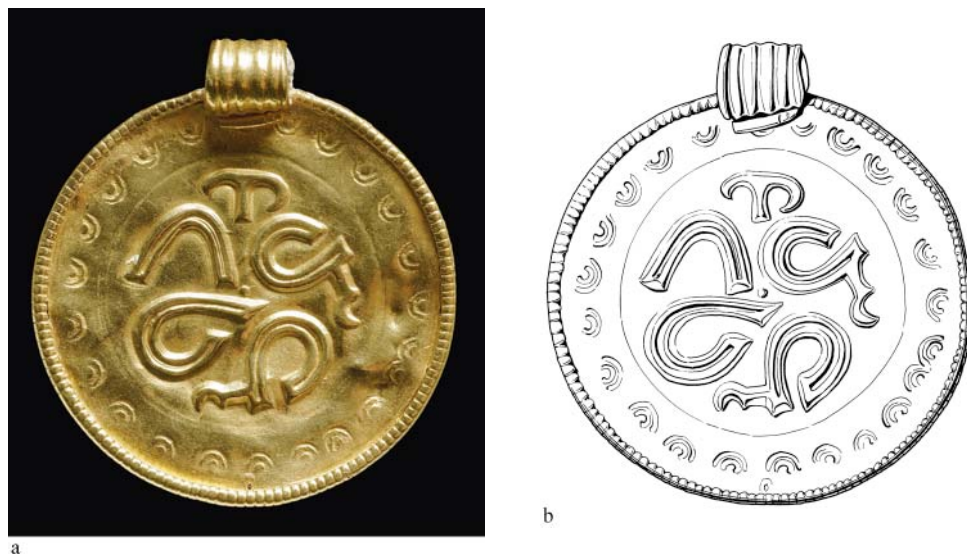
FIG 2 Gold bracteate from Dover Buckland, grave 245. (a) Front. (b) Drawing. Scale 2:1. Drawing by K Morton.

rosette brooch, both with garnet inlay; a silver shield pendant and two silver rivets. In the belt area a buckle made out of silver, bronze and iron with garnet inlay was found together with a bronze rivet, a knife and several iron keys. Behind the head was a spindle whorl.