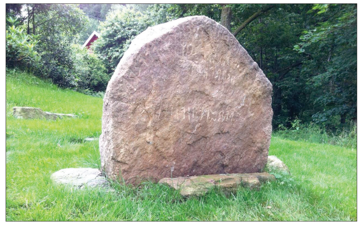
Figure 1. The re-erected Hogganvik-stone at its original location. Estimated height is 135 to 145 cm with its base hidden in the ground.

covered Hogganvik stone from Mandal in southern Norway. The discovery came on 26 September 2009 when Arnfinn Henriksen together with his son, Henrik Henriksen, decided to move a large stone slab between two stumps on his lawn some 20 m in front of his house. The runes on the bottom side of the stone block came to light when it was turned on its edge and raised up by an excavator (Fig. 1). The stone block, which roughly measures 145 cm (height) ×